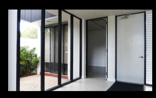
Large Conference Room